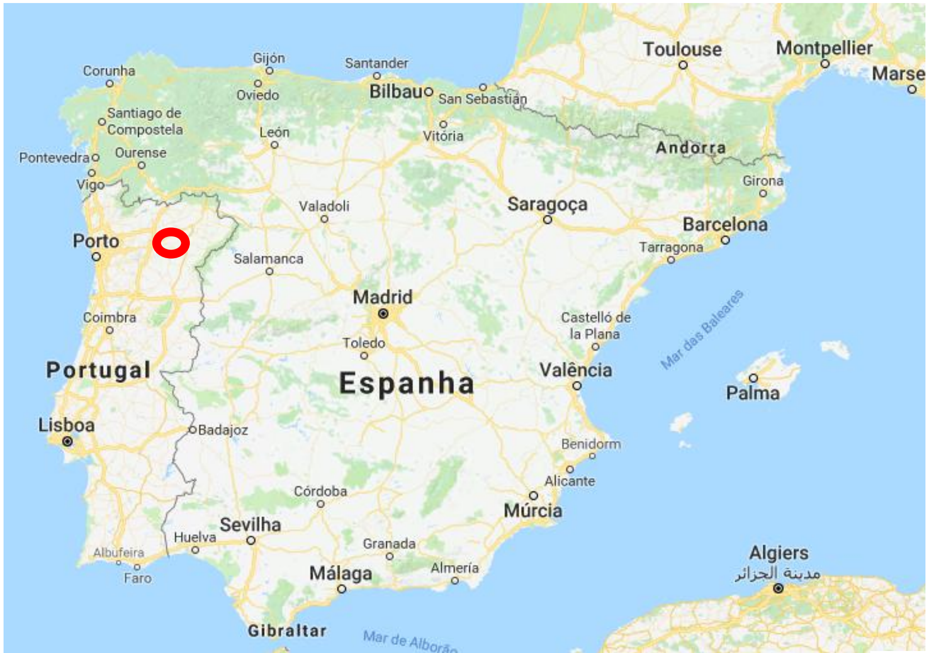
PRIMA - Information Event, March 5th 2018, Sevilla, Spain