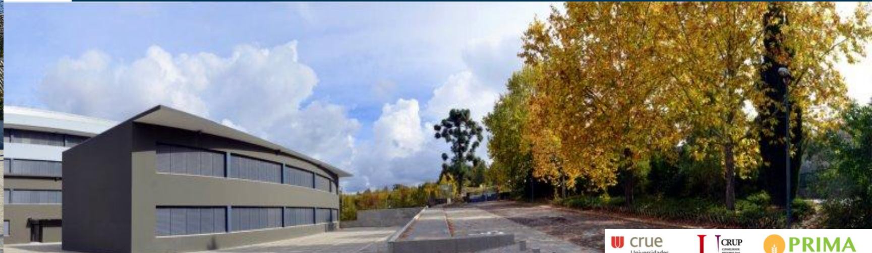
PRIMA - Information Event, March 5th 2018, Sevilla, Spain